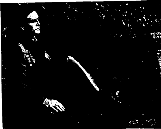
Shouting of versatility and elegance, this gray and black herringbone is enhanced by threads of light blue and rose running through the fabric. The suit jacket is tailored with single-stitched edges, a center vent and patch pockets with flaps. The trousers feature a straight leg design. From Austin Reed of Regent Street.