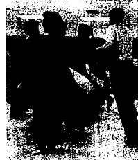
Area square dancers are looking forward to June '82 in Detroit when they will convene to consume of mass quantities of do-c-dos.