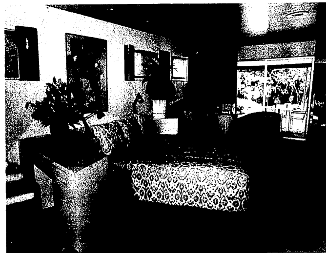
The long bedroom wall which runs parallel with the one shown is all mirrored. Behind the mirror panels are banks of roomy closets and the glamorous master bath done in

TELEGRAPH AT LONG LAKE ROAD (18-MILE) BLOOMFIELD HILLS • 641-7370