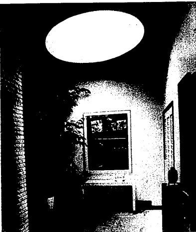
Entry hall with its shades of gray and white, plus Brooker painting, sets the mood for the rest of the house.