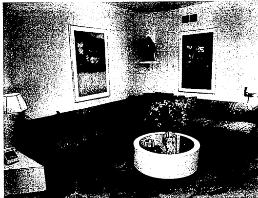
This small study or sitting room didn't suffer from lack of attention. It has all of the

The mirror work throughout the house was done by Glass Design Enterprises. It is an easy to care for home with built-in convenience in a contemporary setting — an excellent background for two busy occupants who also happen to like modern art.