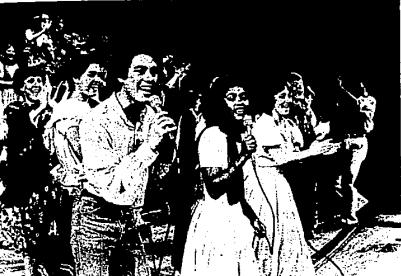
Four casts of Up With People will combine for the halftime show during the Super Bowl game Sunday at the Pontiac Silverdome.

The city of Pontiac has designated the week Jan. 17-24 as Pontiac Super