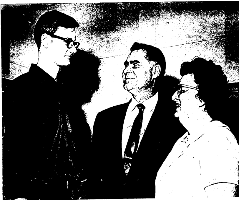
His parents have nothing but smiles as they look up at the big son who has done so well.

Observer Photos By Craig Gaffield, Vince Witek