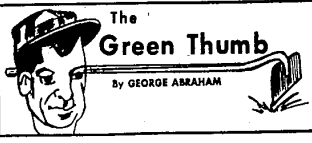
The Green Thumb By GEORGE ABRAHAM

Those in the Persian Carpet mixture are white, while the red, each pointed petal tipped or bordered with a contrasting shade. These blossoms are smaller by an inch of diameter. Then there is the delightful Thumbelina—different that it won one of the few gold medals ever awarded in the All-America trials. Miniatures of the big fellows, only six inches high, these plants bear double and semi-double blooms of white, yellow, pink, lavender, orange and scarlet. Buds open when plants are only half grown.