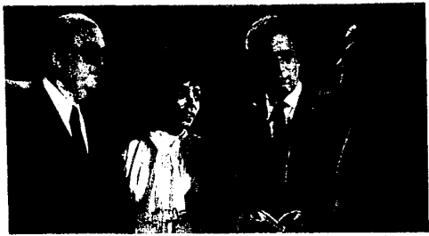
KING BENEFIT—Producers Ely Landau and film stars Ruby Dee and Paul Newman confer with director Sidney Lumet at Rice Park City just prior to filming final special dramatic recording sequences for the film "King A Filmed Record... Montgomery to Memphis." The benefit film will be shown in Livonia's Terrace Theater Tuesday, March 24, at 8 p.m.

Music will be provided by The Steel and Valvet. Advance tickets are priced at $2.50 for men and $2 for girls, while the tickets at the door are $3 and $2.25.