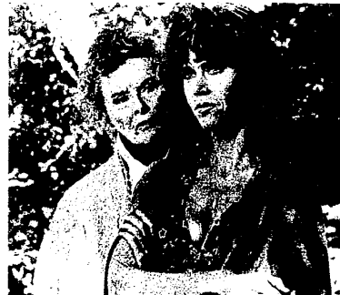
Fonda's own daughter Jane portrays his daughter Chelsea in the film, and Kathryn Hepburn is the wife and mother, Ethel Thayer.