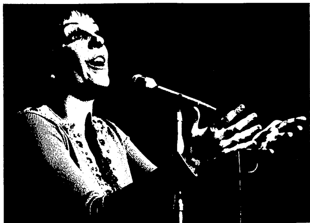
Monte Nagler used a 200mm lens with an exposure of f-4 at 1/25 second to take this shot of Liza Minnelli. A black background adds impact to the picture. The action was captured at its peak.

Have you ever been to a circus, an ice show, or your favorite performer's concert and wished you could bring home good photographs to preserve the memories?