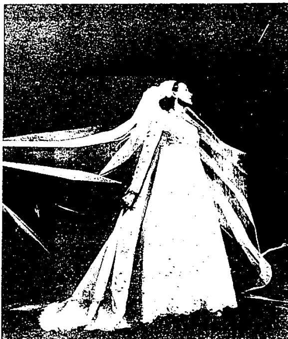
GOWN FOR A bride of yesterday, today and tomorrow. Lines go high, focus interest on bride's face. Head-hugging cap holds yards and yards of illusion veiling. Important new features include attached train, venise lace trim, dimensional embroidery and heading. Gown and headpiece by Galina.