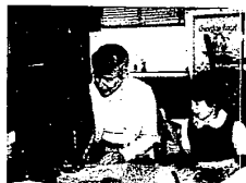
VALUES THAT WILL LAST A LIFETIME