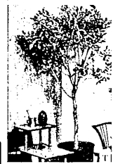
OFFICE TONIC—A tree will transform a cold office into an interesting, relaxing room.

If possible, mulch the new seeding. Any loose material that conserves moisture and protects the soil will suffice.