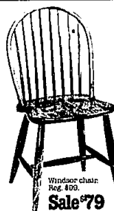
Windsor chair Reg. $99.