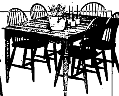
Golden oak extension table. Features 2-12" leaves. Closed size: 36"x36", open, 36"x60". Reg. $459.