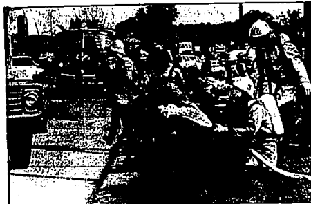
In the disaster, firefighters sprayed the leaking tanker with cold water to cool it down and prevent it from bursting into flame. Rescue workers wore gas masks and carried heavy oxygen tanks while helping those overcome by the gas.