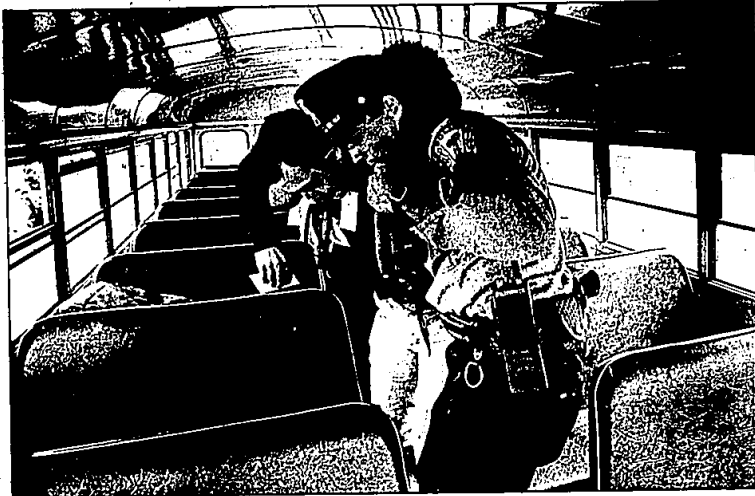
Victims who were overcome by the gas were helped off the bus by Troy police officers and rescue workers.

The disaster was captured on video tape by the Troy police and firefighters. The tape will be used to further study and improve emergency responses.