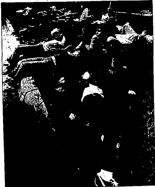
The injured didn't take their roles lightly, laying on the grass outside the disaster. Some got into the drama by moaning, others by assisting their injured "classmates."