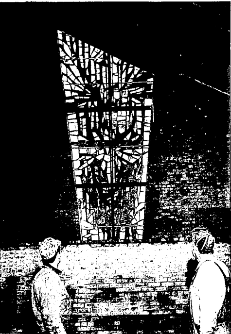
STAINED GLASS ART -- A stained glass window designed by famed artist Jacques Duval of New York City was installed this week in the new sanctuary of St. Paul Evangelical Lutheran Church of Livonia. The new building is located on Farmington Road between Six and Seven Mile Roads. When it is completed, the congregation will turn over its present building on Farmington Road south of Five Mile to the Livonia Civic Center development. Here two workmen admire the window right after installation.

Kol Ami services are held in the Birmingham Unitarian Church at Lone Pine and Woodward.