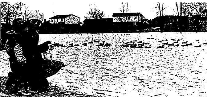
Feeding the ducks in a Farmington Hills pond was the way Pat Sullivan and her son J.P. spent Tuesday morning. They left when the winds picked up and blew the corn back at them.

The sleds, ice skates and toboggans stayed stacked under the tree Christmas Day as temperatures in the area reached a record high of 64 degrees.