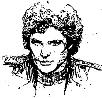
David Hasselhoff, star of NBC's "Knight Rider," will appear at the Pontiac exhibit on Saturday, Jan. 15, from 2-4 p.m. and 7-9 p.m., and on Sunday, Jan. 16, from 2-5 p.m.