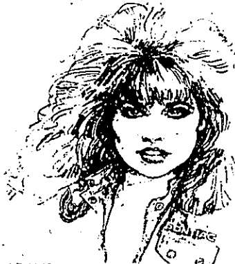
Pontiac's Firebird Girl will appear at the Pontiac exhibit throughout the nine-day Detroit Auto Show.