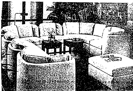
8-piece Harridon Modular Sectional, as shown Sale $2,262.

Discover the Wiggs combination: fine quality traditional furniture and accessories at excellent Winter Sale prices plus the professional advice of talented IDS interior designers and salespeople...a combination that ensures the best values for your home furnishing dollars. Come spend some browsing time with us! Sale ends 3/5/83.