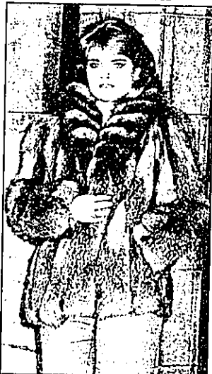
Illustrated: Canadian Red Fox Jacket from the Gervais collection as seen on channel 9, 10 PM News.

DUTY AND SALES TAX REFUNDED RATE OF PRESENT EXCHANGE 22%