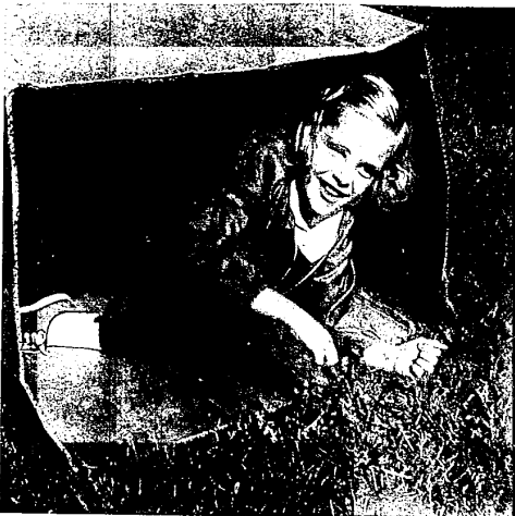
REMOVING DANGER -- Playing in cardboard boxes is lots of fun for the younger set but playing inside abandoned refrigerators is very dangerous. If you want to keep your good junk but get rid of the dangerous stuff, Farmington Township wants to help.