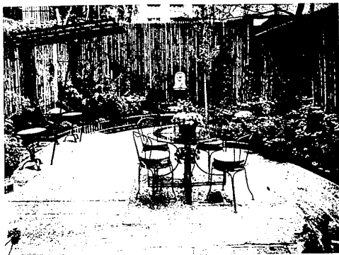
PLAN EXCITEMENT -- Even the smallest garden can provide excitement for all members of the family. Turn the entire garden, or the corner of a larger garden, into the focal point for cocktail parties or an escape for quiet reading and meditation.

Beware of glowing word descriptions and faked photographs of climbing vine peaches, giant climbing strawberries, 1,000 giant red roses on a single bush (unknown to horticulturists), flower shade trees that grow roof high in a single year, including the "Flowering Maple" that turns out to be the common silver maple with most inconspicuous blooms, etc.