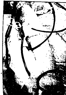
A vein and artery are surgically connected in the arm to allow dialysis to occur as easily and painlessly as possible.

She has always been attracted to working with chronically ill patients.