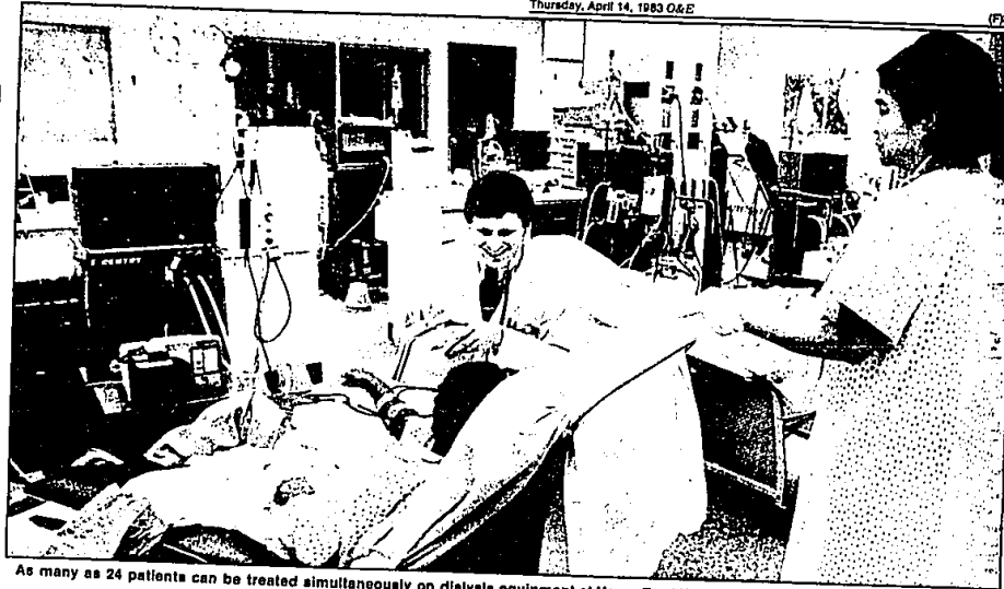
As many as 24 patients can be treated simultaneously on dialysis equipment at Henry Ford Hospital-Troy Center.