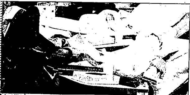
Some people just cover up and escape from it all during treatment, which lasts 3½-4 hours at a time.