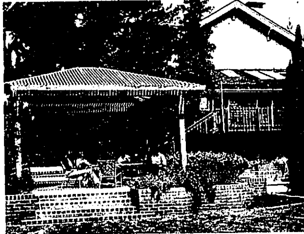
One way to add more space to your home is to build a deck. Greater enjoyment of your property can be the result of a deck when you cover formerly unusable sites or extend the inside of your house to the outside.

● Sensory force: This is one of the most basic aspects of design. It should