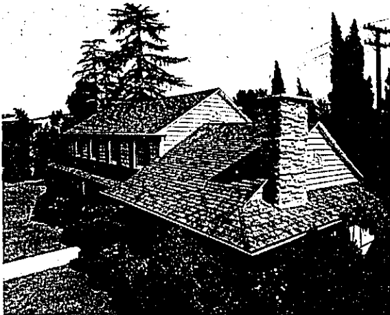
A roofing contract should specify brand name of roofing materials, time schedule, financial arrangements and warranty.