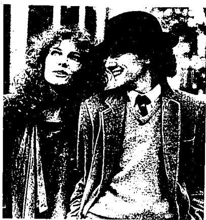
Jacqueline Bisset as Mrs. Burroughs and Andrew McCarthy as Jonathan Ogner have an affair, but her characterization is never fully explained, in "Class."