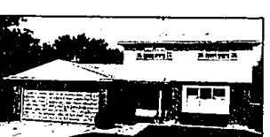
SOUTHFIELD - Mint condition updated colonial has been newly decorated. 3-4 bedrooms, 1 1/2 baths, family room with fireplace, eating area in kitchen, central air, and a spacious carpeted basement. $83,500. (H-46092).

MOVING TO LA JOLLA-SAN DIEGO AREA? NEED HELP IN RELOCATING? CONTACT JOHN HANNETT 646-6200