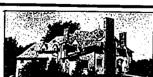
EUROPEAN CASTLE IN BLOOMFIELD HILLS! Old World elegance best describes this one of a kind home with slate roof, terrazo, terrazzo entrance, beautiful moldings, ceramic floor in kitchen, 5 bedrooms (master with built-ins), cedar closet, all new carpeting, finished entertainment room, 3 new furnaces plus offices. Many details too numerous to mention! Call today! $495,000. (H-48474)