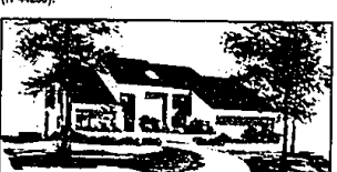
BLOOMFIELD HILLS SCHOOLS - Newly constructed contemporary home still has choices available. This knockout design features 4 bedrooms, 2 full and 2 half baths, library, 3 car garage and many special amenities. $259,900. (H-46138).