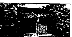
SOUTHFIELD! - Mint condition updated colonial has been newly decorated. 3-4 bedrooms, 1 1/2 baths, family room with fireplace, eating area in kitchen, central air, and a spacious carpeted basement. $83,500. (H-46092).