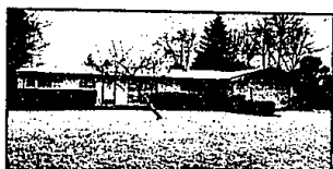
PINE LAKE PRIVILEGES! Contemporary, open feeling plus 3 way fireplace and cathedral ceilings make this starter home a unique place to live. 3 bedrooms, 1 1/2 baths and more. $89,000. (H-40008).