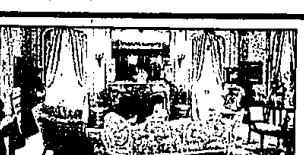
SOUTHFIELD! - Especially nice condo with charm and privacy. This lovely unit backs to open area with 2 bedrooms, 1 1/2 baths, central air and 1 car attached garage. $69,900. (H-43851)