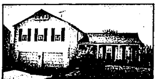
FARMINGTON HILLS - Beautiful 4 bedroom quad level home in prime family neighborhood. Numerous amenities include formal dining room, large family room, office or 5th bedroom, central air, and custom deck overlooking lovely yard. $99,900. (H-46045).