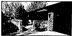
BIRMINGHAM - Private street leads to a perfectly maintained ranch which offers privacy to enjoy the heated and filtered pool, beautifully landscaped grounds and the elegant and open feeling of the great room lends itself to simple and intimate entertaining. 2 bedrooms and library. (H-40654).