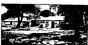
OPEN SUNDAY 2-5 . 4155 Orchard Way, Birmingham. N. off Maple, W. of Telegraph. FOXCROFT! Move-in condition ranch has 3 bedrooms, 1 1/2 baths, living room and family room with fireplace and extras galore. BLOOMFIELD HILLS SCHOOLS . $125,000. (H-33461).