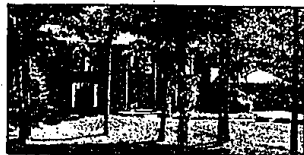
BLOOMFIELD HILLS SCHOOLS - Desirable area of newer built homes is the location of this stunning contemporary with ceramic foyer, great room, library, formica kitchen, a laundry/mud room plus patio and decking overlooking woods. $229,900. (H-43935).