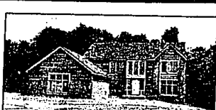
WEST BLOOMFIELD - Kay building Corp. proudly presents this contemporary colonial with marble foyer, 4 bedrooms, 2 1/2 baths, great room, library, deluxe kitchen and more. Call for more information on this very well priced home. $189,000. (H-44258).