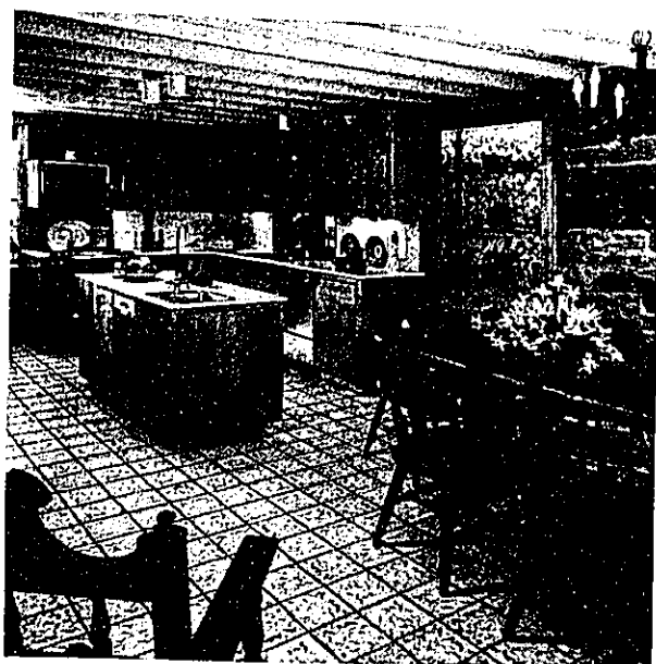
This remodeled kitchen opens completely to the dining area for a smooth, flowing transition from one to the other. Custom pine cabinets, ceramic tile floor, island counter, drop lights and exposed stone walls create a kitchen/dining area that is modern but country in flavor.