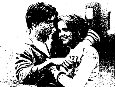
Stef and his girlfriend, played by Lisa Thompson, both have ambition, but she's an aspiring musician who has little hope of getting a college scholarship.

Even so, "All the Right Moves" is a refreshing film, not caught up in any hype. It has modest ambitions and it realizes them.