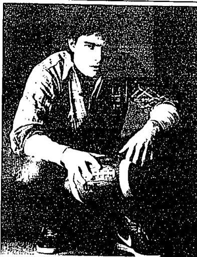
Tom Cruise as Stef Djordjevic, who wants to get out of a Pennsylvania steel-mill town by winning an athletic scholarship, in "All the Right Moves."