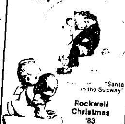
"Santa in the Subway"