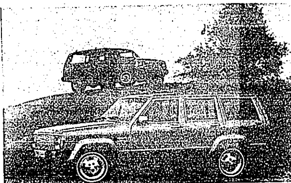
The 1984 Jeep Wagoneer Limited (foreground) and the Jeep Cherokee offer the latest in four-wheel drive engineering technology, computer aided design, aerodynamic testing and robotic manufacturing.