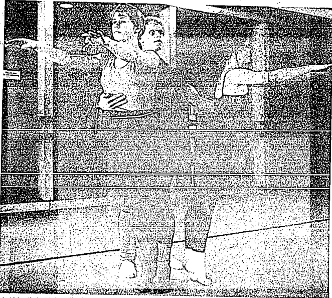
Feb. 3 and 4 will mark the first performance of the Harbinger Dance Company at the new Walter F. Smith Performing Arts Center at the Orchard Ridge Campus of Oakland Community College in Farmington Hills.

Performance time is 8 p.m. Tickets are priced at $3 for students and senior citizens; $4 for advance sales and $5 at the door. For ticket information, call the theater at 471-7700 or Harbinger at 477-7014.