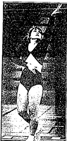
Dona Kebrdle N. Farmington