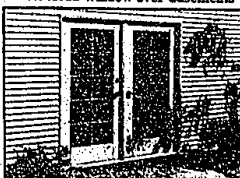
Traditional French Door

See the NEW PELLA Double-In-Swing Traditional French Door and Circle Top Windows together with all the new PELLA IDEAS at your local showroom.