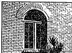
Circle Head Window over Casements