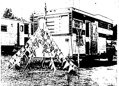
WHAT IT'S ABOUT -- A couple from England brought their collection of pennants testifying to travels around the British Isles and Europe. No, they didn't come all the way by camper truck. They rented it here, with local hosts making the arrangements.