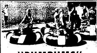
"BUMPUMS" SEVERAL "BUMPUMS" CARS WILL BE AVAILABLE FOR RIDES AT THE DOWNTOWN FARMINGTON CENTER DURING THE THREE FOUNDERS FESTIVAL DAYS. THE "BUMPUMS" WILL ALSO BE IN THE PARADE SATURDAY.