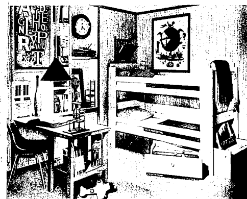
DO-IT-YOURSELF PROJECT — This room for a young boy could be a guide for young fathers anxious to give "junior" a comfortable, attractive room of his own at a reasonable cost.

Bunk beds can be built in the home shop or purchased for further space economy.