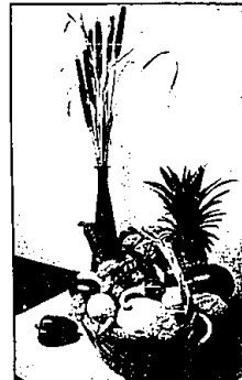
Justine Noetzel took a blue ribbon for her basket overflowing with vegetables in the artistic design division, "To Market, To Market."