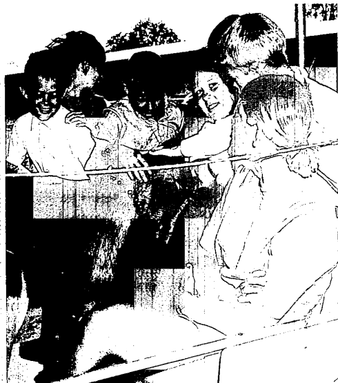
WHO'D THINK a goat could get so much attention from youngsters.