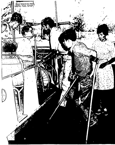
WHEELCHAIRS, crutches make no difference when one rides in style

YOUNGSTERS from the special education classes in the Farmington school district wanted to see the horses. So Bill Kofender, promotion and publicity director at the Detroit Race Course, made arrangements for a morning tour of the plant, including watching the morning workouts. To add a bit of zest to the visit, a horse was brought out from the stable area and this is what happened. The kids couldn't get enough and were moaning and groaning when the horse was taken back to his stall. There was ice cream, milk, pop, hot dogs, donuts and everything else that goes with the appetites of youngsters ... and a chance to see the horses.