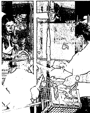
NOTHING LIKE milk to make a day complete.