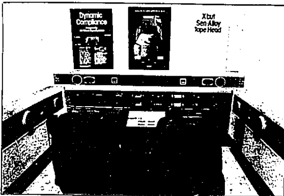
Car Stereo Sound Room

At the Gramophone, we take car stereo seriously and so do our customers. Many of them, because of their lifestyle or occupation, actually spend more time listening to stereo music in their car than they do in their home. Our car stereo system prices begin at $199, including installation.