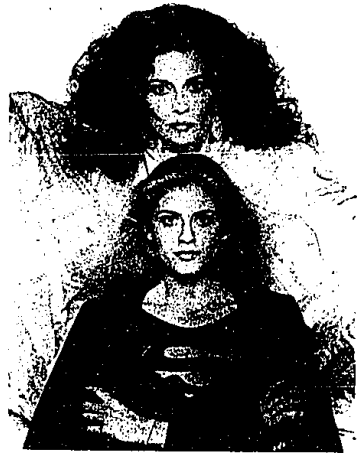
Helen Slater is Supergirl, who meets three villains including would-be witch Selena, played by Faye Dunaway.