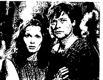
Mia Farrow and Simon Ward portray Supergirl's parents, Alura and Zor-El, in "Supergirl."

Another considerable attraction of "Supergirl" is the visual impact it has. The extensive special effects staff provides a wide array of visuals to delight the eye, and that's a good deal of the fun with comic books. The matting of Supergirl in flight is sufficiently well-done so that the often-disturbing fringing effect of poor-quality mattes is eliminated. Whether flying from inner space or fighting various demons, "Supergirl" effectively presents imaginative images.