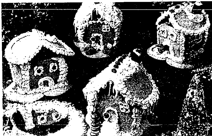
These cookie houses are easy to make when you eliminate a lot of the work by using refrigerated cookie dough.

For ornaments, thread one piece of yarn through hole and tie. (For placecards, use two pieces of yarn. Tie two cookies together loosely by threading yarn through holes.) Decorate as desired. 36 cookie ornaments or 18 cookie placecards.