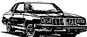
A. Cutlass Supreme