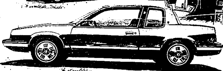
A. Cutlass Supreme

Detroit Auto Show...January 12-20...Cobo Hall