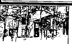
EVERGREEN WOODS. Ambience, atmosphere, affordable, air conditioned, beautiful, bargain, charm, convenient, desirable, deal, efficient, EVERGREEN WOODS, fantastic financing, freeways, gracious, harmonious, handsome, ideal, immaculate, incomparable, just lazy, knotty, lovely, luxurious, lodge, leisurely life, magnificent, money-maker, $64,900 to $78,900. ASK FOR MARCIA MEISEL.