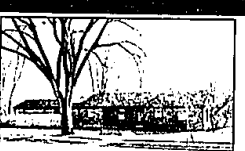
ASSUMABLE FIXED RATE MORTGAGE. Unique ranch on a big country lot in town Birmingham. Interior is furnished in beautiful wood. 2 fireplaces, finished basement, attached garage. Priced at just $81,900.