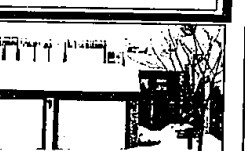
GOING...GOING...GONE! Walnut Grove Condos. Only 1 ranch and 2 townhouses left. 2 bedrooms, 2 baths, basement, 2 car garage, fireplace. Truly elegant. Priced from $68,900. ASK FOR WILLIAM HAWKINS.