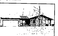
WINTER SPORTS ON WOLVERINE LAKE. Less than 500 feet from the door of this 4 bedroom, 2 bath ranch home with cathedral ceilings. Wood dock and attached 2 car garage. $65,900.