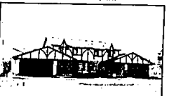
ENGLISH MANOR DUPLEX in Lathrup Village, for a couple weeks, remember my previous suggestion. Place a piece of plastic or an old shower curtain in the bathtub and put your collection of potted plants on the plastic and fill the tub with a couple inches of water.