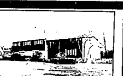
LAND CONTRACT! Contemporary flair with tradition. 5 bedrooms, 3 1/2 baths, library plus den. Fireplace in master bedroom and family room. Birmingham Schools. Priced under market value. $239,000.