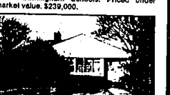
ROYAL OAK RANCH close to Birmingham. Rec. room with built-in fireplace. 3 bedrooms, 2 baths, basement. 2 car garage, school within walking distance. Reduced. $81,500. ASK FOR AUDREY JOLLEY.