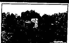
LUXURY AND PRIVACY in this contemporary home of cedar and glass with open spacious living area overlooking a forest of pine trees. 3 bedrooms, 2 1/2 baths, much more. ASK FOR OLA DUNN.