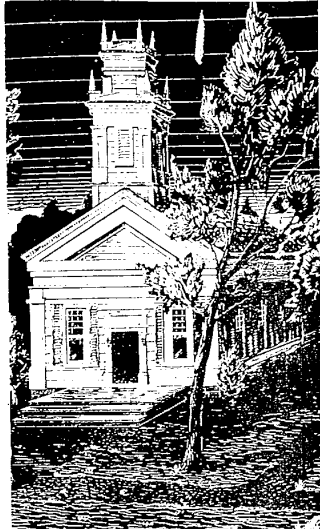
1848-1948—The Congregational Church, Wayne, Mich.

But workmen using a blowtorch to remove paint from the bell tower set off a fire that gutted the old church. Shown here are an artist's print of the church as it was seen for more than a century and our photographer's record of the fire's devastation.