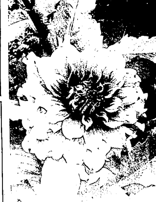
THIS "INFORMAL decorative type" dahlia has a shaggy head of curly petals. It is a small dahlia, with flowers about four inches in diameter.