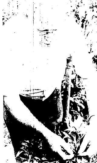
JOSEPH GIES demonstrates how he "disbuds" his dahlias to produce exhibition blooms with larger flowers and longer stems. Sturdy stakes are needed to support the plants, each of which is carefully labeled.

Dahlias make good cut flowers for indoor bouquets. Even a single large bloom makes an attractive display. They have a dramatic form that seems particularly appropriate in modern, contemporary settings. The cut blooms can last a week or more. They should be cut in early morning or evening. Blooms will last longer if the ends of the stems are dipped in boiling water or charred in a flame for a few seconds or if a small bit of stem is snipped off under water. Among the beautiful varieties that will be on display in the Gies garden are "Explosion," a huge apple-nosed flower that combines bright yellow and flame orange; "Mary Elizabeth," an older variety of a soft red color that has won many awards; "Johnny Casey," with small red and white flowers like peppermint candies; "Lala Patti," a spectacular creamy white with blooms as large as a head of cabbage; "Doris Dada," a three-foot tall plant with ball-type flowers of salmon pink touched with gold; and "New Fun," a charming plant that grows over a foot high with four-inch apricot tinted flowers-shaped like water lilies.