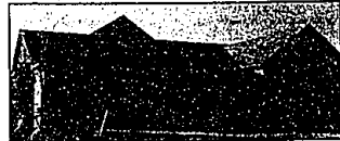
PRESTIGIOUS BEACON WOODS. This gorgeous walk out ranch has everything. Neutral decor. Professionally landscaped. Custom decks. Alarm system, sprinkler system, premium lot. Crown molding, 2 fireplaces and more. Reduced to $179,900. 348-6430.