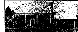
DOWNTOWN FARMINGTON. Custom Cape Cod offering 4 or 5 bedrooms, 3 baths, huge family room with wet bar and fireplace plus huge, gorgeous back yard. $98,800. 477-1111.