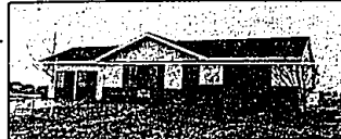
BUILDERS MODEL. Immediate occupancy. 3 bedroom brick and aluminum ranch is located on cul-de-sac, professionally decorated and landscaped. Many extras. Located in area of expensive homes. $80,000. 651-1900.