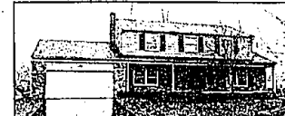
FARMINGTON HILLS! Beautiful 4 bedroom colonial. Prime Colony Park lot near schools, YMCA and swim club. Redwood deck overlooking Commons. Contemporary decor, central air, Quick occupancy. $134,900. 477-1111.