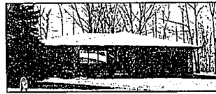
BRICK RANCH. Classic elegance in luxurious living. 3 bedrooms, on wooded lot. Circle drive with Birmingham schools. Full basement with life floor, neutral color thru-out. New carpet, new kitchen cabinets, no wax floors, screened in porch. $101,000. 559-2300.