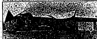
NEWLY CONSTRUCTED. Immediate occupancy. 3 bedroom, 2 1/2 bath ranch featuring large, open great room with fireplace and wet bar, formal dining and breakfast area. Consider it - it's a deal! $115,000. 651-1900.