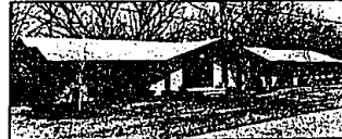
WOODED RAVINE SETTING. Perfection in this walkout custom ranch. Overlooks woods and stream. Enjoy the comfort of appreciation. Possible Land Contract. Realistic seller transferred. $119,900. 651-1900.