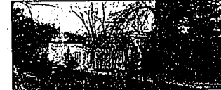
DOWNTOWN FARMINGTON. Custom Cape Cod offering 4 or 5 bedrooms, 3 baths, huge family room with wet bar and fireplace plus huge, gorgeous back yard. $98,800. 477-1111.