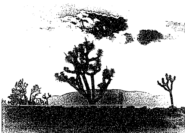
A light reading off the bright sky in this Monte Nagler photograph underexposed