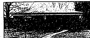
ANOTHER TEMPTING BUY! 3 bedrooms, 2 full baths, family room, brick ranch. Finished basement, marble tile, quality home. Assumable. $56,700. 559-2300.