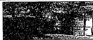
CHARM - Country kitchen. Lovely to live in. Excellent taste and pride of ownership abound. Redecorated to perfection in neutral colors. Lovely private setting. Live in luxury! $92,500. 651-1900.