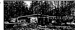
PRIVACY, TREES, NATURE year around living for the active family. Indoor swimming pool, in-law suite, court yard, 2 fireplaces and open floor plan. A wonderful view in every direction. $149,900. 477-1111.