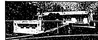
DOWNTOWN FARMINGTON. Custom built brick ranch in very nice area. 3 bedrooms, master bath, Florida room and living room with fireplace. Immediate move-in condition. Immediate occupancy. $84,900. 477-1111.