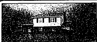
LARGE 3 bedroom Tri-Level in a country sub. Backs to woods and fields. Large lot. Novi schools. Excellent location. $92,000. 348-6430.