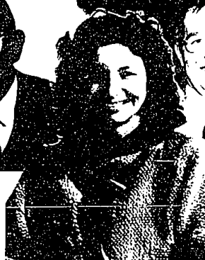
Esther Broner, acclaimed author of five books