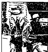
HOT LEAD, COLD FEET