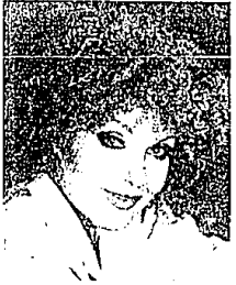
Jazz stylist Cleo Laine (left), and singer Gayle Moran and husband Chick Corea appear on a double bill Friday night at Meadow Brook Music Festival.