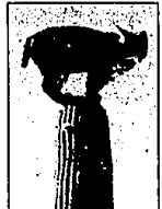
THE LIVING DESERT